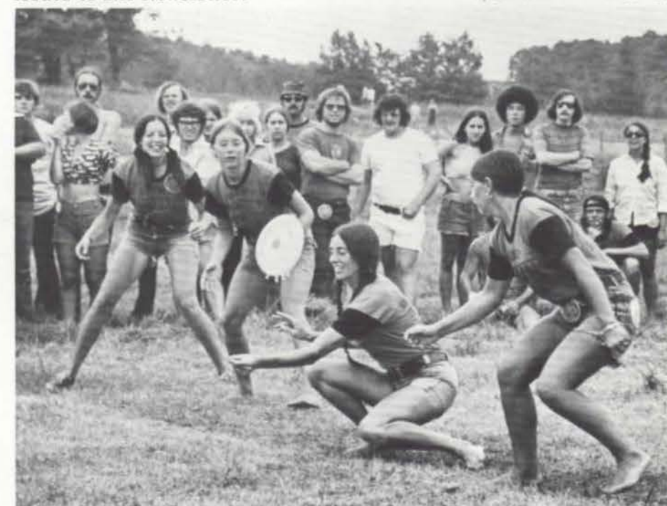
CROWD PLEASERS—Only women's team entered in Guts Frisbee Competition, the Humbly Magnificent Champions of the Universe Ladies, from Ann Arbor, Mich., acquitted themselves well. We used their picture this year because we got tired of running photos of the Highland Avenue Aces.