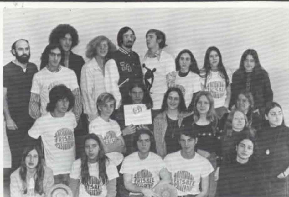
HAPPY GROUP is pictured in this photo which depicts members of the Schreiber Frisbee Association of Port Washington, N.Y.