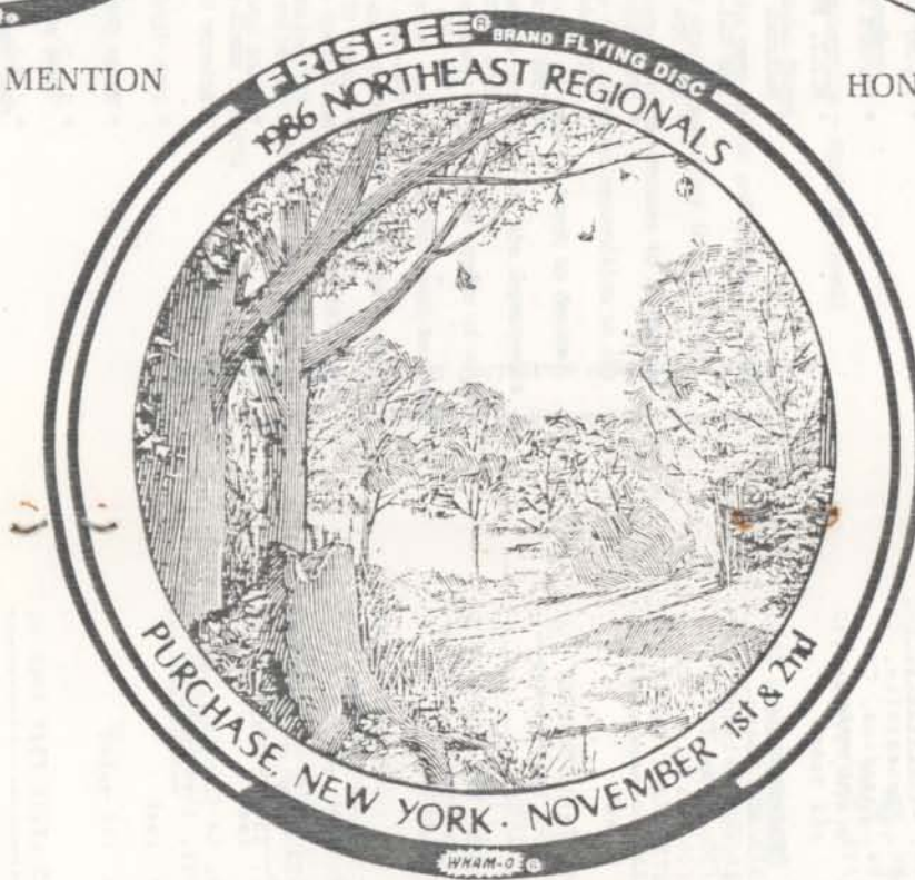
1986 DISC OF THE YEAR