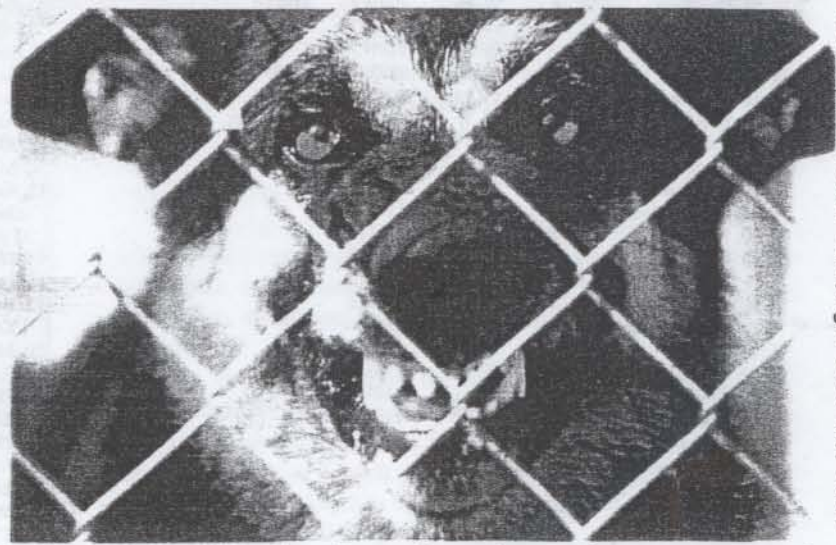
Hole 1, Watertower Park, Right side, 'nuff said.

Instant insanity, Anytime, Anywhere, for any occasion. Rockpile Cartoons (941)748-4010